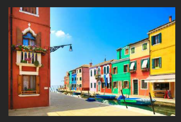
The Southern Lagoon is defined by the elongated islands of Lido and Pellestrina on the sea. We will see some of the smaller islands like Poveglia and San Spirito are abandoned today but have fascinating histories. Others like San Clemente or Sacca Sessola are now exclusive hotel islands.

Explore the Northern Lagoon, which features the magnificent, multi colored islands of Burano and Torcello with their hidden corners and alleys.