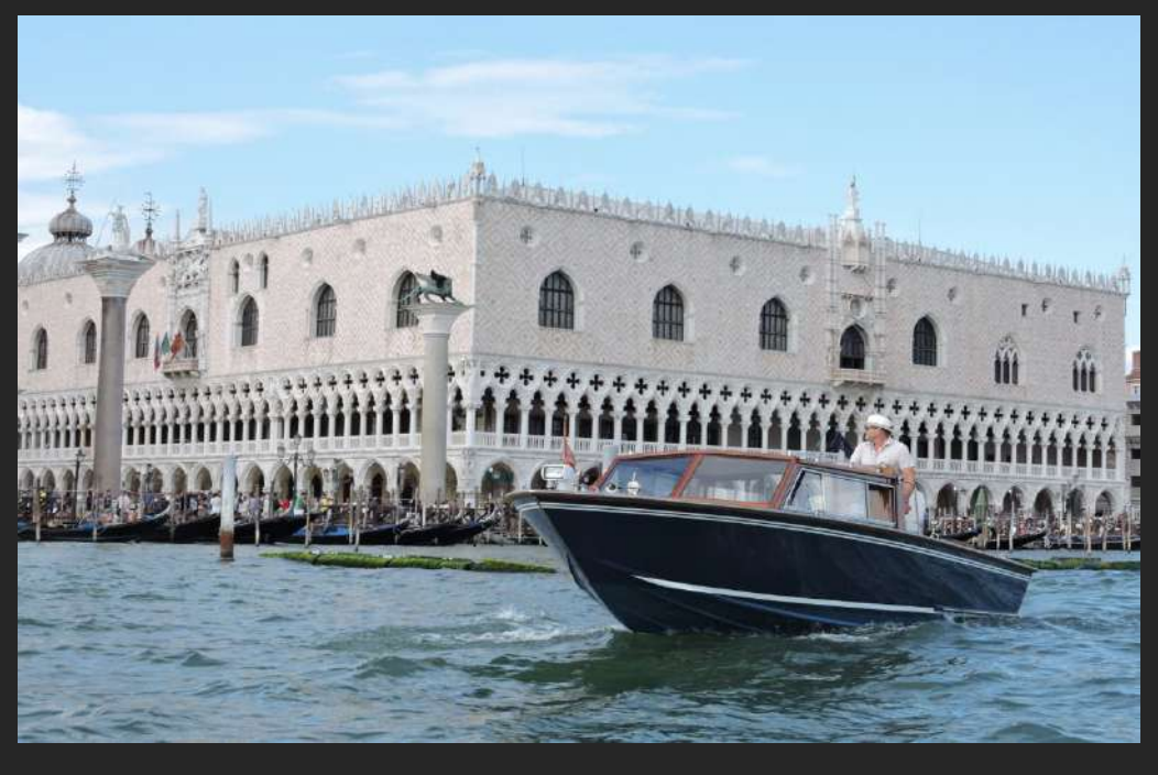
A day cruise to discover the lagoon, its history and culture. Get on board a classic traditional Venetian boat powered by electric and hybrid engines